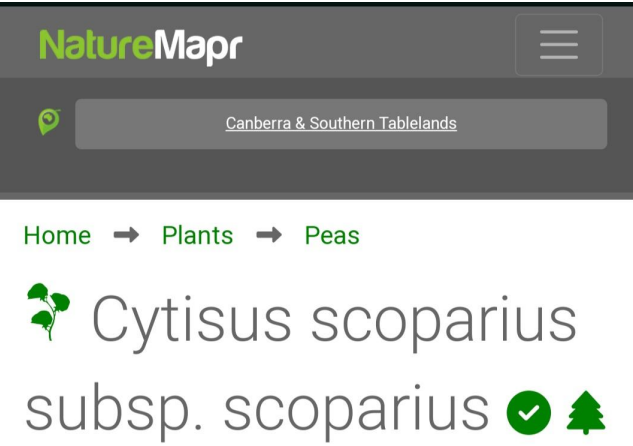
Figure 1: Screen shots from NatureMapr app

Scotch Broom, Broom, English Broom at Namadgi National Park