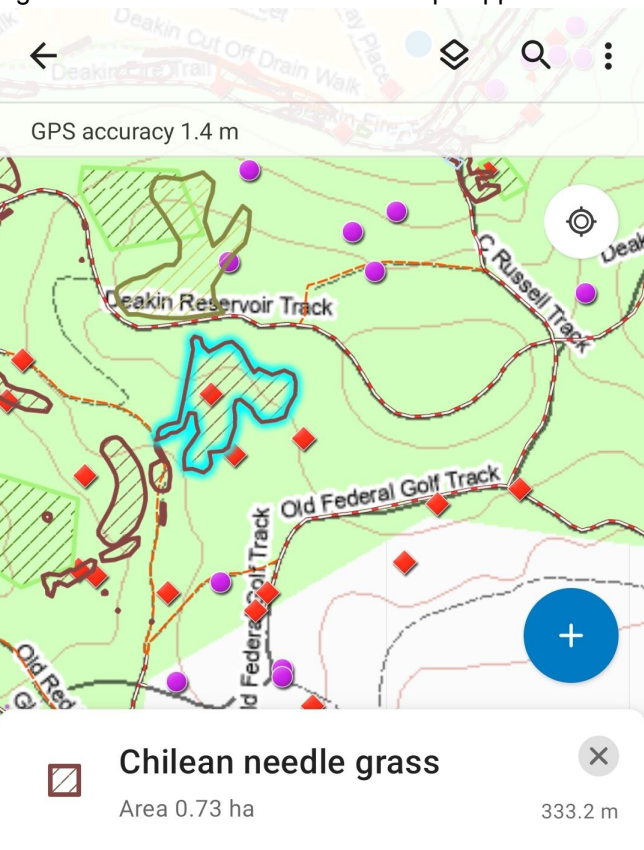
Figure 2: Screen shots from Field Maps app